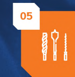
Nails & Screws