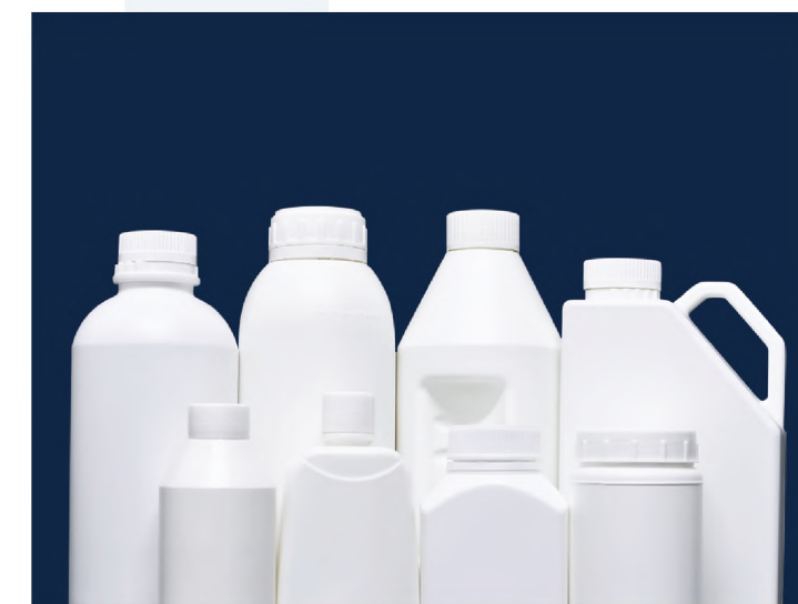
All kinds of cans, bottles, jars for veterinary, aquaculture, agricultural pharmaceuticals, cosmetics