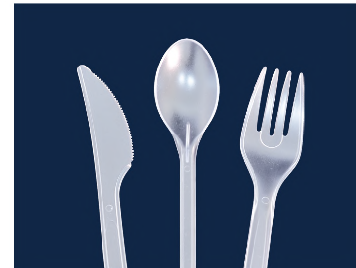
All kinds of can lids, handles, knives, spoons, forks... used in food, pharmaceutical, healthcare