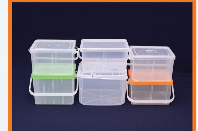
All kinds of plastic boxes and containers for steel nails and screws